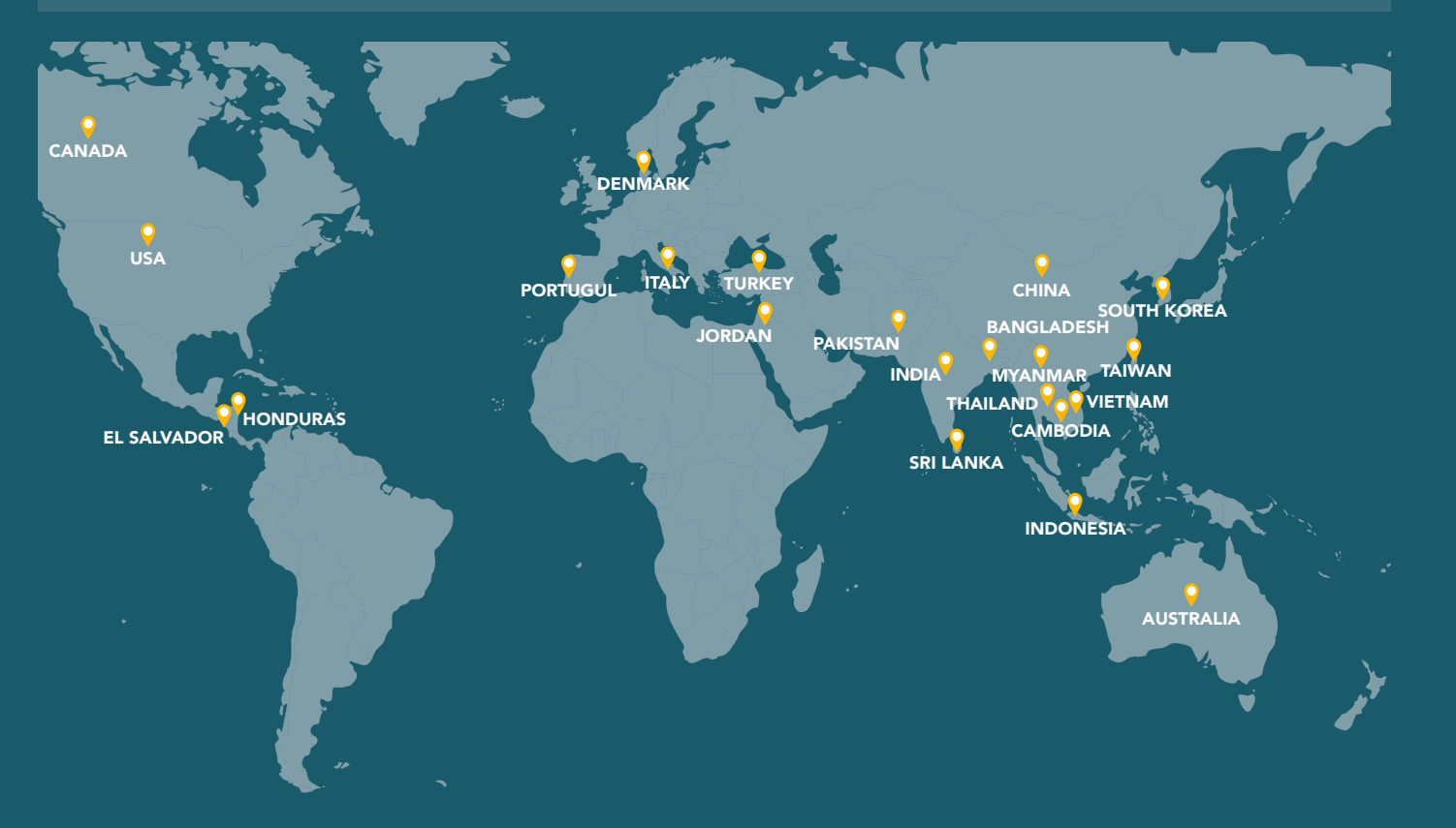
Figure 2: Hanes Australasia goods for resale manufacturing locations, 2021

Includes cleaning, customer support, finance, IT software and support, marketing, professional services, transport and logistics and warehousing.