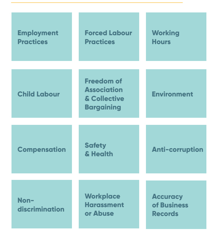
Figure 7: GSS compliance areas

9.\ https://hbisustains.com/wp-content/uploads/2020/09/HBI-COC-2020-Print-Manual.pdf