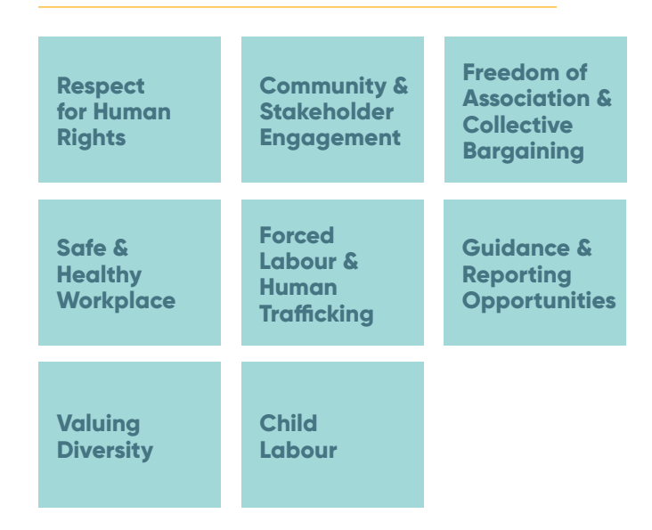
Figure 6: Human rights focus areas