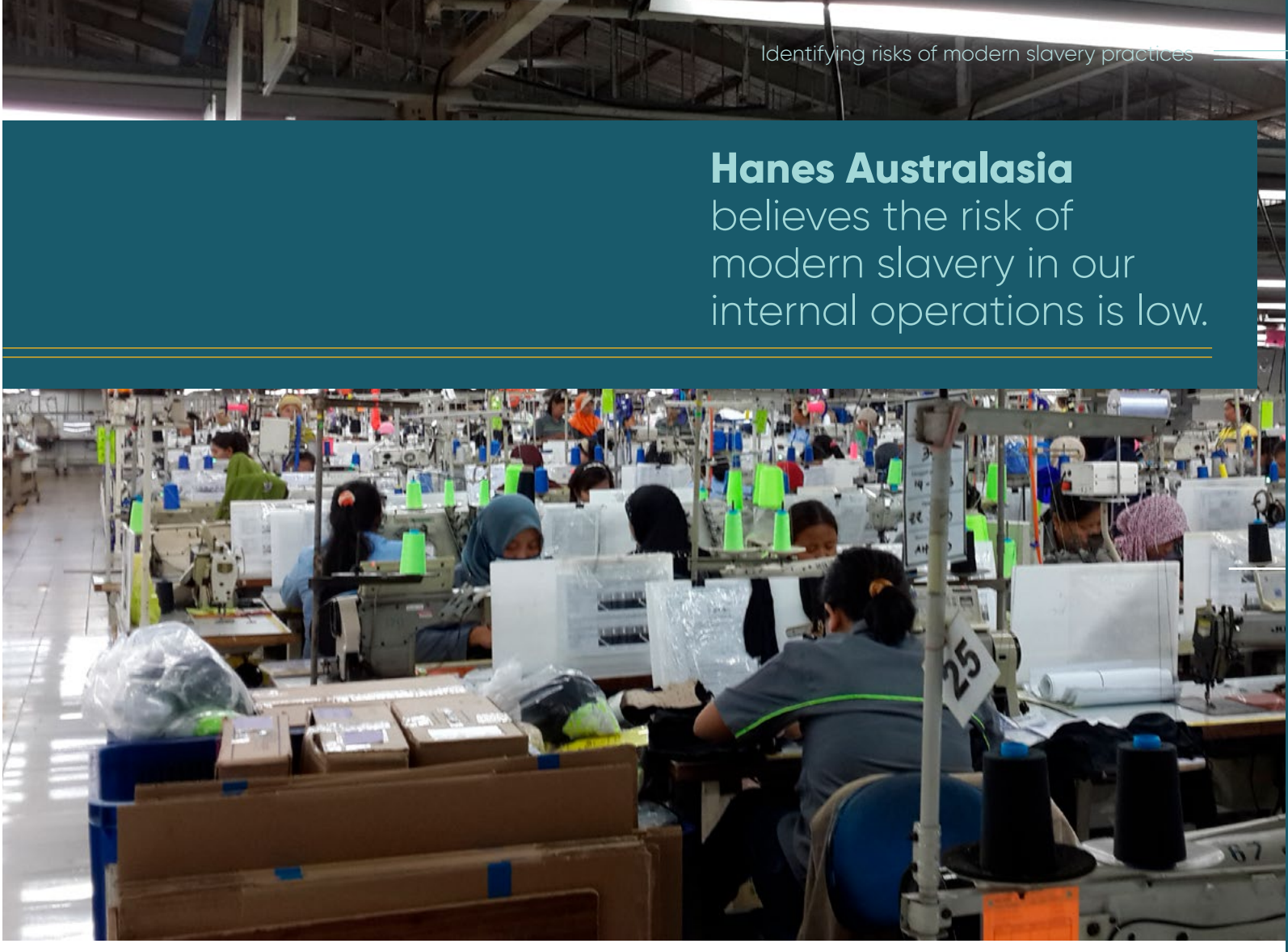
Figure 4: Industry modern slavery risks

• Outsourcing of all or part of production to un-authorised facilities