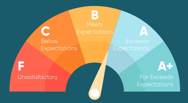
Figure 9: GSS Compliance Levels

The lowest-scoring facilities are placed on our Alarm Report for flagged high risk violations that need immediate action.