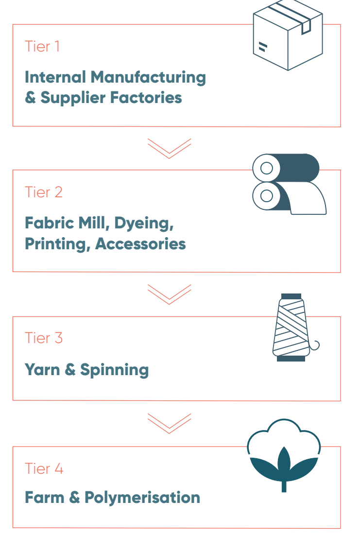
Figure 5: Supply chain tiers

The apparel industry is broadly structured into four tiers, as indicated in the diagram below.